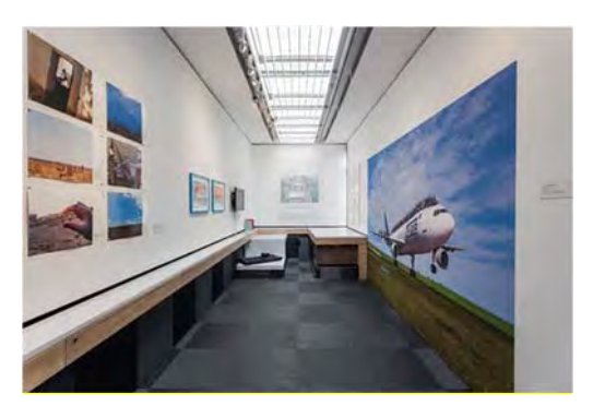
Travelling Gallery installation view