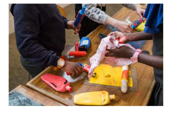
Children enjoying our printmaking workshops at WHALE Arts, Wester Hailes, Edinburgh