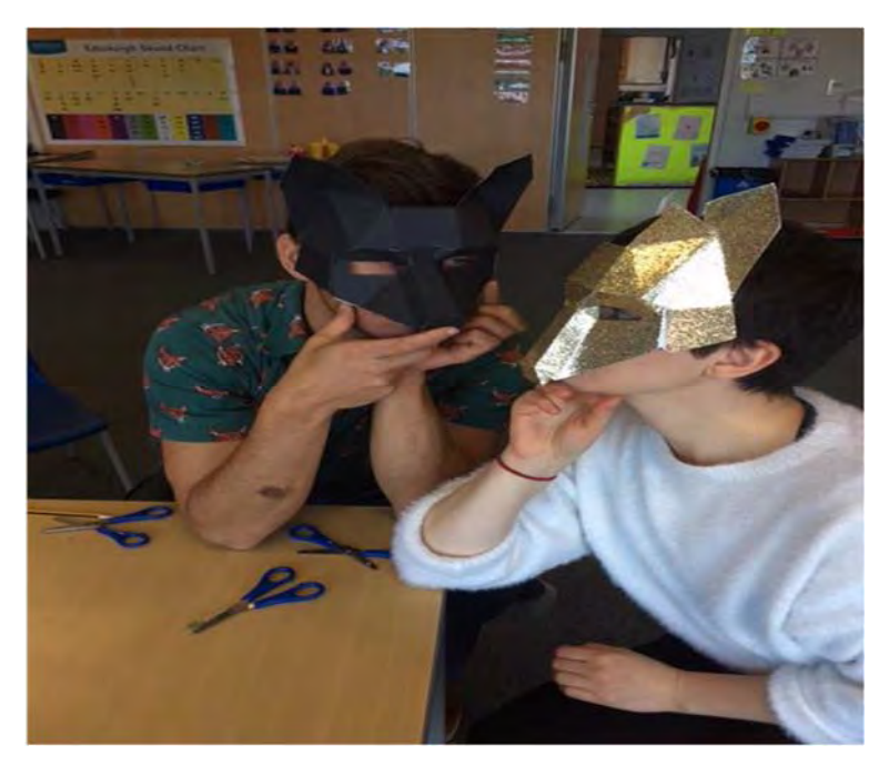
Back2School: Breakout! at Niddrie Mill Primary School.

A grant of £5,850 was awarded to produce the 'Back2School' residency project, delivered in partnership with Niddrie Mill Primary School (Craigmillar), bringing live dance, theatre, music and art interventions into the school environment.