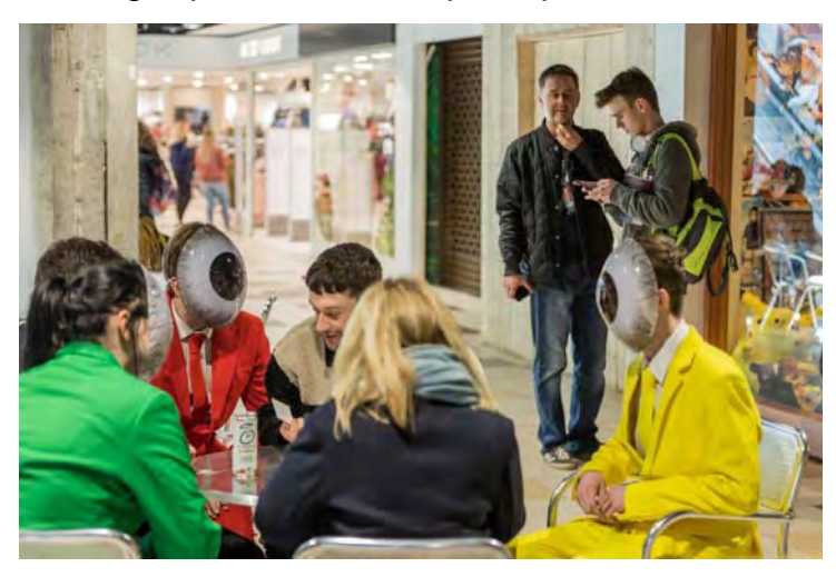
Shoplifter/Shapeshifter engagement activities Waverley Mall April 2018

Shoplifter<>Shapeshifter will also be performed at Imaginate's family day on Saturday 25 May 2019 at the National Museum of Scotland before going on to the West End Festival in Glasgow. The Company tells us: "Shoplifter<>Shapeshifter is the project that just doesn't end! It keeps growing and evolving which is brilliant...... We've had a lot of fun exploring where the piece works and where it doesn't. It's been a lot of trial and error which has been a really good learning experience for our participants"