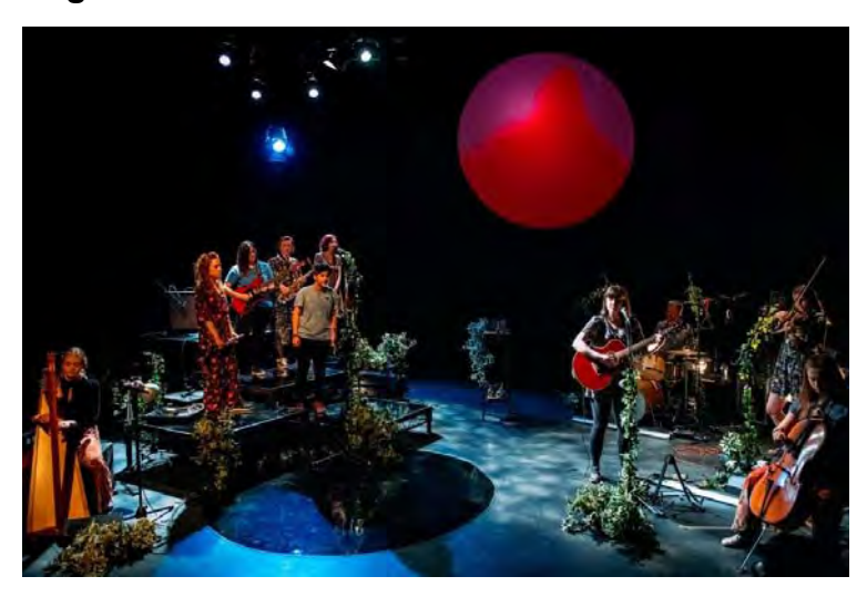
Lost in Music.

A grant of £5,000 was awarded to develop Lost in Music, a new music/theatre work aimed at a young adult audience. It explores the relationship of young people to music, and its importance to identity. It was produced by Magnetic North in partnership with North Edinburgh Arts (NEA) and had two distinct phases: