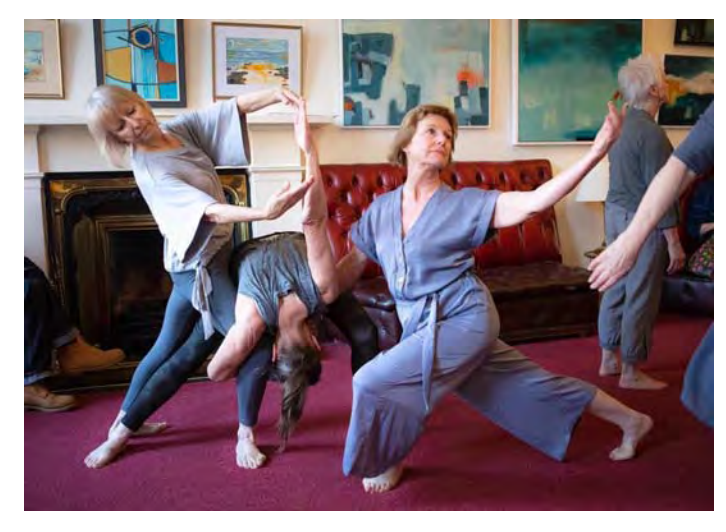
Glimpse at the Scottish Arts Club.

A grant of £5,000 was awarded to develop <u>Glimpse</u> – a site-specific, immersive, multi- artform and multi-generational performance in partnership with the Scottish Arts Club. Glimpse was curated by Dance Base's artistic director to animate the Arts Club in a new and radical way. Choreographic creativity, spoken word and film was used to give insights into the past, present, and future of the building, with references to visual arts throughout with tableaux vivants from some of the great Rennaisance masterpieces to text written by Edvard Munch and references to Warhol and Charles Atlas.